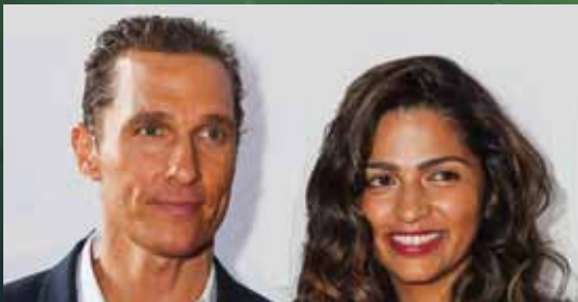
Matthew and wife Camila Alves

As a native Texan, McConaughey had what could be considered an All-American upbringing. He was raised Methodist, played sports from a young age, and was voted by his high school classmates as "most handsome student." But he wasn't really interested in acting until he graduated from the University of Texas with a degree in Radio-Television-Film. At that point, he realized he didn't want to attend law school as planned—and indeed, fate had other things in mind. On the heels of his cult performance in Dazed and Confused , McConaughey was cast in A Time to Kill . He may not have become a lawyer in real life, but he did play a lawyer in his first performance as a Hollywood leading man.