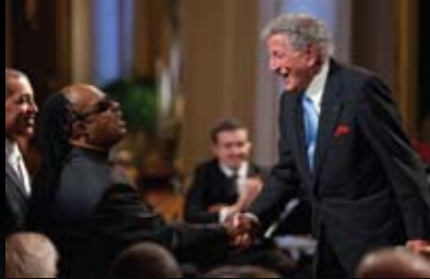
Greeting Stevie Wonder at the White House in 2009

It was another characteristic shared by Leo and Tiger—that of family loyalty —that pulled Tony back from the brink of self-destruction. As it turns out, his son Danny had all the talent in business that he himself lacked. Tony's decision to put his career in Danny's hands turned out to be one of the best he ever made. Within a handful of years his debts were cleared , his fortune on the rise , and his image revitalised . Tony was once again recognised as a timeless treasure , and modern artists—everyone from Sting to Lady Gaga —were lining up to work with him.