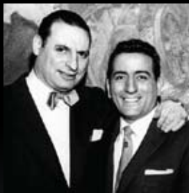
With talk show host Irv Kupcinet in the 1950s

It's not entirely true to say that Tony had no help finding his way into show business. On top of growing up in New York City, which is an advantage in itself, his Uncle was a tap dancer who gave him a personal glimpse into the world of entertainers. By the time Tony was 10 years old, he was already performing—most notably at the opening of the Triborough Bridge, where the Mayor of New York City listened to him sing and ruffled his hair. As is often the case with Leos, Tony's star was shining bright and early.