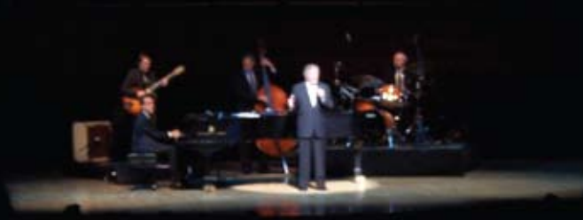
Tony Bennett performs in Philadelphia, 2005

career. An early post-war gig in Greenwich Village found entertainer Bob Hope in the audience, who immediately recognised Tony's magnetism and invited him on tour. Four years and several hit records later, Tony was a bona fide star—so much so that when he married in 1952, two thousand female fans appeared outside a cathedral in New York, all dressed in black, to mourn the 'loss' of their favorite heartthrob.